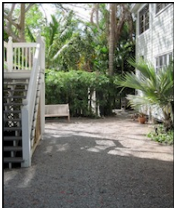
corner from just inside Southard St