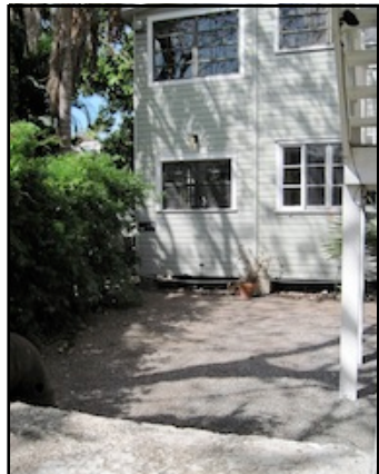
Rear garden view from cistern (mango tree house in foreground)