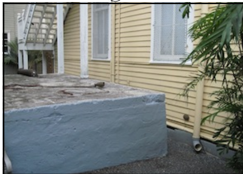
Narrow connecting path, right side of cistern

EXISTING FIRST FLOOR PLAN SCALE: 1/4"=1'-0"