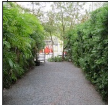
Looking back at White St entrance, from cistern