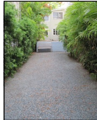
Front Garden from St.