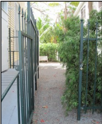
Southard St. Gate